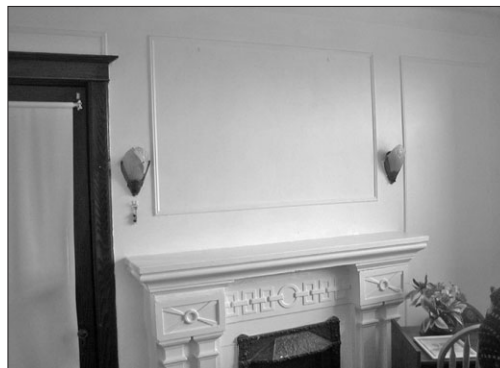
The Jewish Women International of Canada's emergency-housing apartment in Montreal had bare walls before it was adorned with artwork.

Home is a haven, a place where all are safe and where we can restore ourselves from the daily grind of life. Where we can sit amid our belongings and enjoy the serenity of our tranquil surroundings and furnishings, including our objects